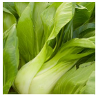
Green Bok Choi