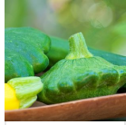
Mixed summer squash