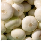
Di Maggio Onions