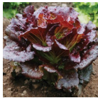
Magenta baby lettuce