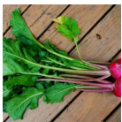
Scarlet Queen turnips