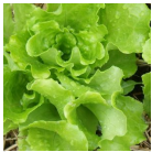
Nevada baby lettuce