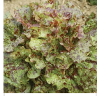
Cherokee baby lettuce