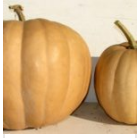
Guarajio Segualca squash