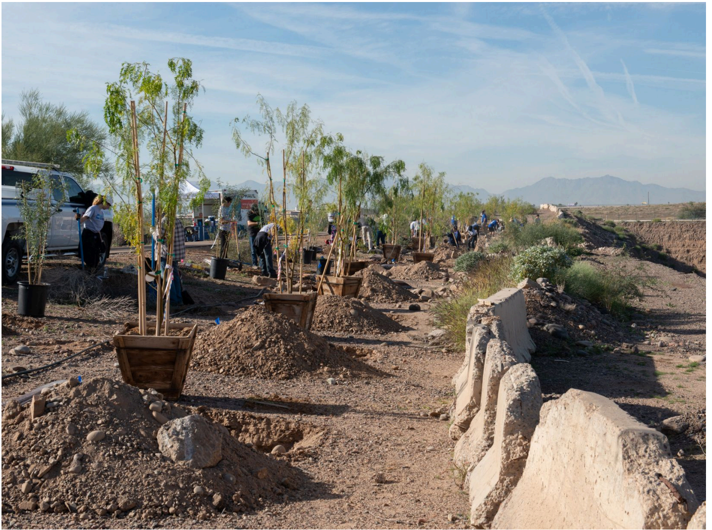
RIO SALADO Volunteers from American Express in Phoenix helped with a planned tree planting along the Rio Salado Preserve.