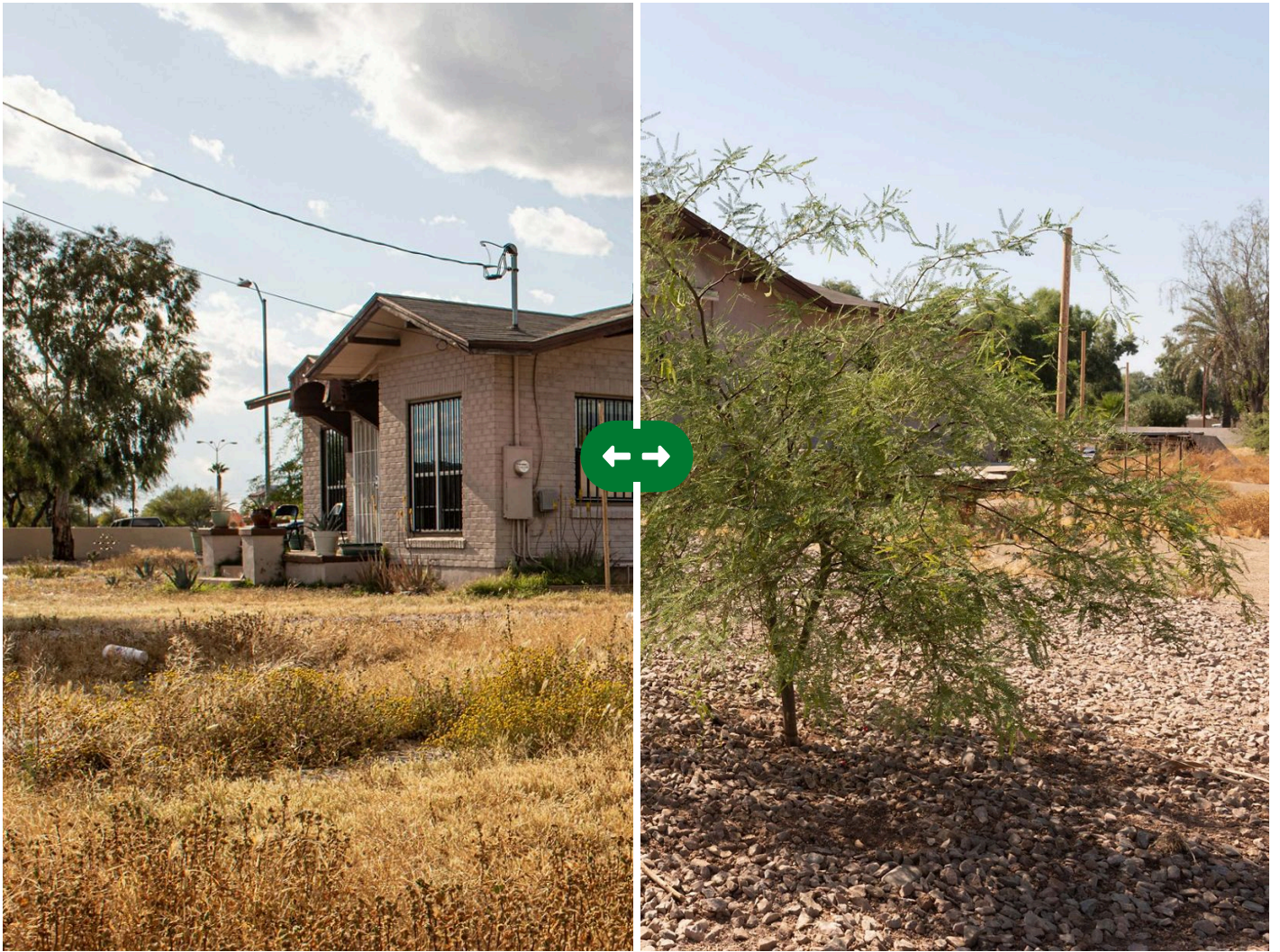
EDISON-EASTLAKE TNC, Trueform Architects and Smiling Dog Landscapes collaborated to plant trees, vegetation and install an irrigation system for maximum rainwater results.