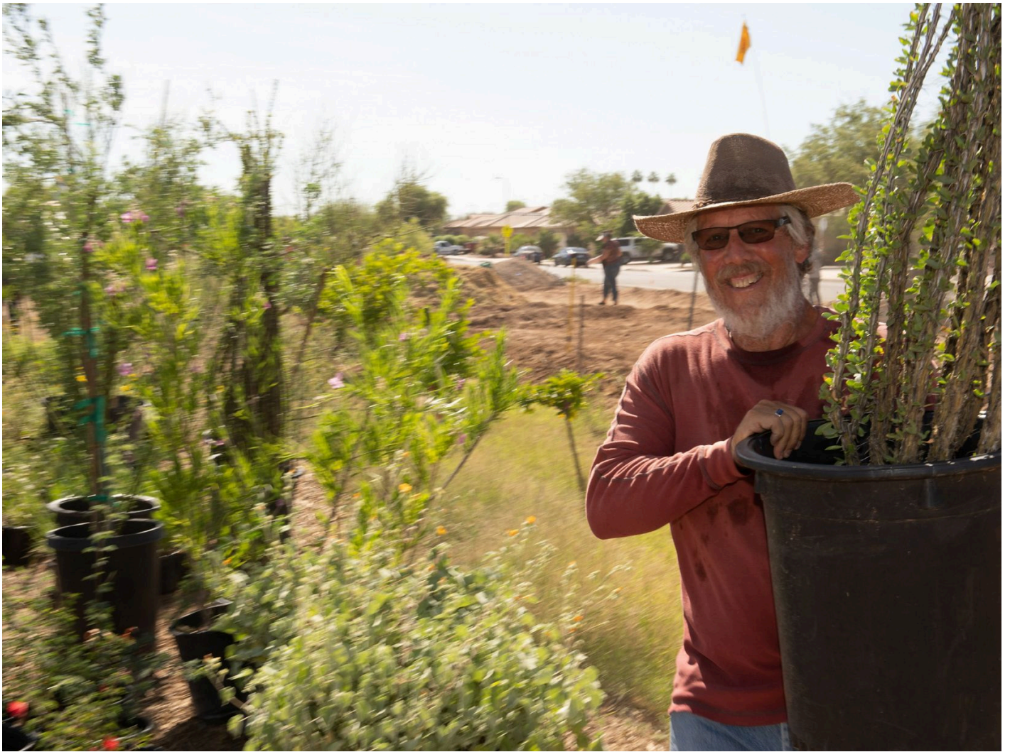
LINDO PARK-ROESLEY PARK TNC and partners planted desert-adapted trees and vegetation to transform the landscape and use rainwater more effectively in a 16,000-square-foot area of an urban garden.