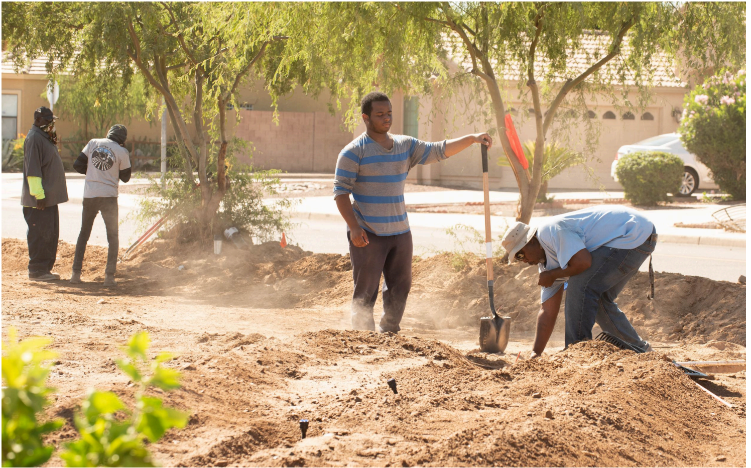
GREENING PHOENIX TigerMountain Foundation and other community partners participated in a community greening at Spaces of Opportunity in South Phoenix.