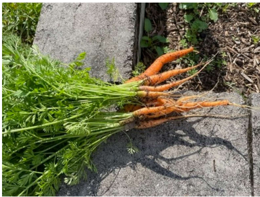
Thinning carrots December 2021