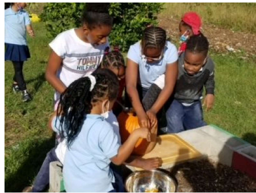
Taylor Park After School Program kids make jack-o-lanterns Fall 2021.