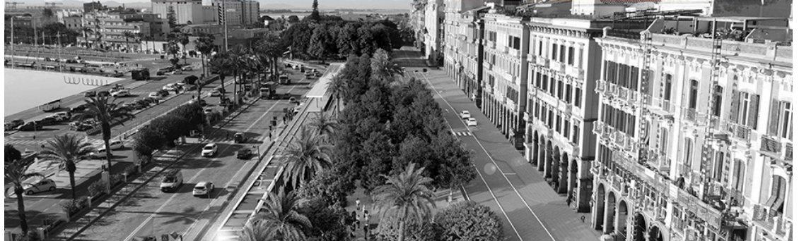
↑ Via Roma © Stefano Boeri Architetti