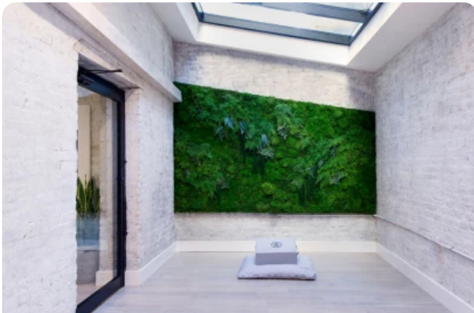
Plant Painting Panel System low-ma... Artisan Moss