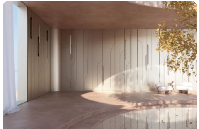
Qbiss Notch Design by Pininfarina Trimo