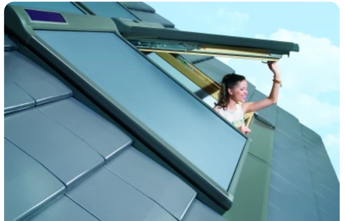
Electric Awning Blind AMZ Solar FAKRO