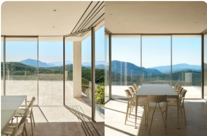
TURNABLE CORNER WINDOW VITROCSA