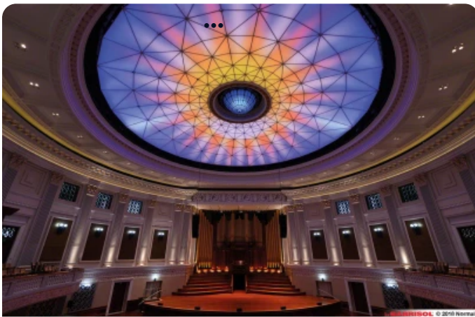
Light Color Ceiling Barrisol - Normalu Sas