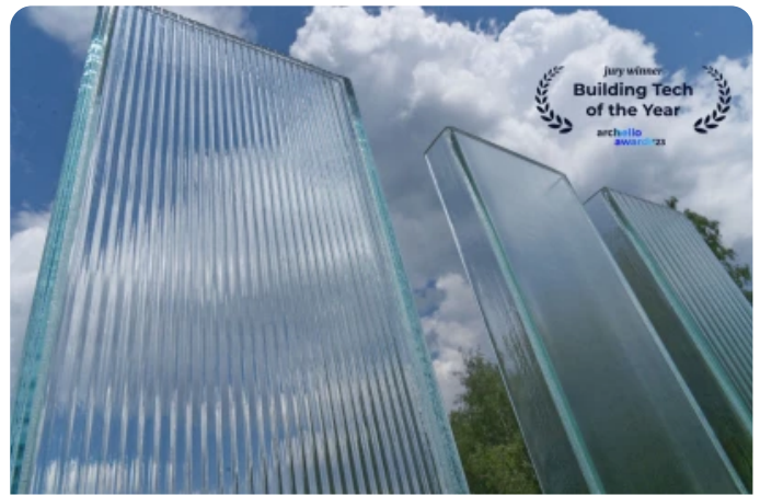
LAMBERTS LINIT EcoGlass (U-Glass) GLASFABRIK LAMBERTS