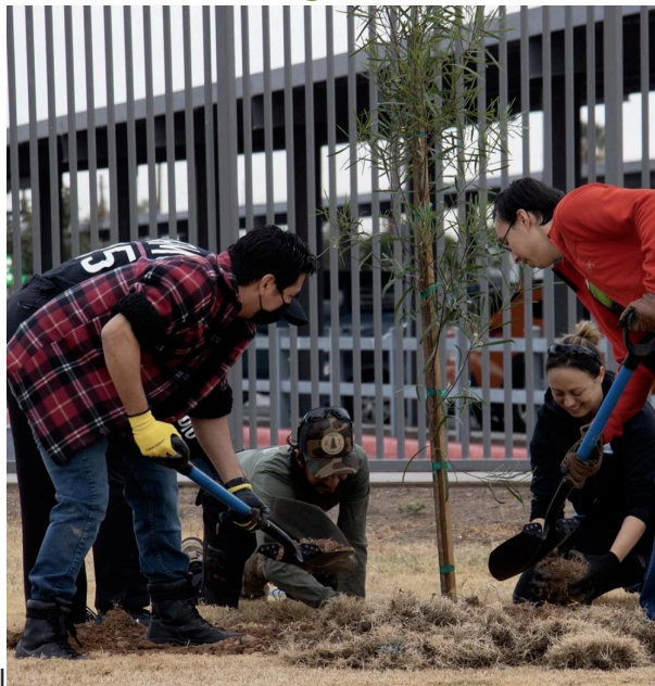
M.C. Cash Elementary School