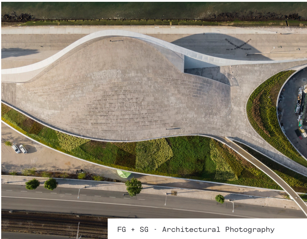
FG + SG - Architectural Photography