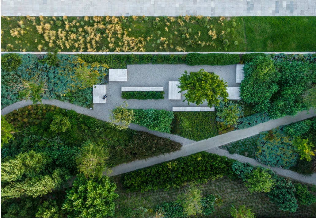
FG + SG - Architectural Photography