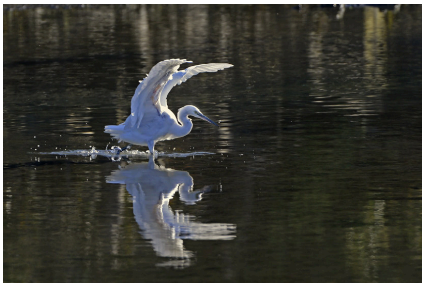
Little Egret on Booterstown Marsh

marsh land was filled in. Now however, what remains is an incredibly important around 4 hectares of habitat for protected birds and plant life.