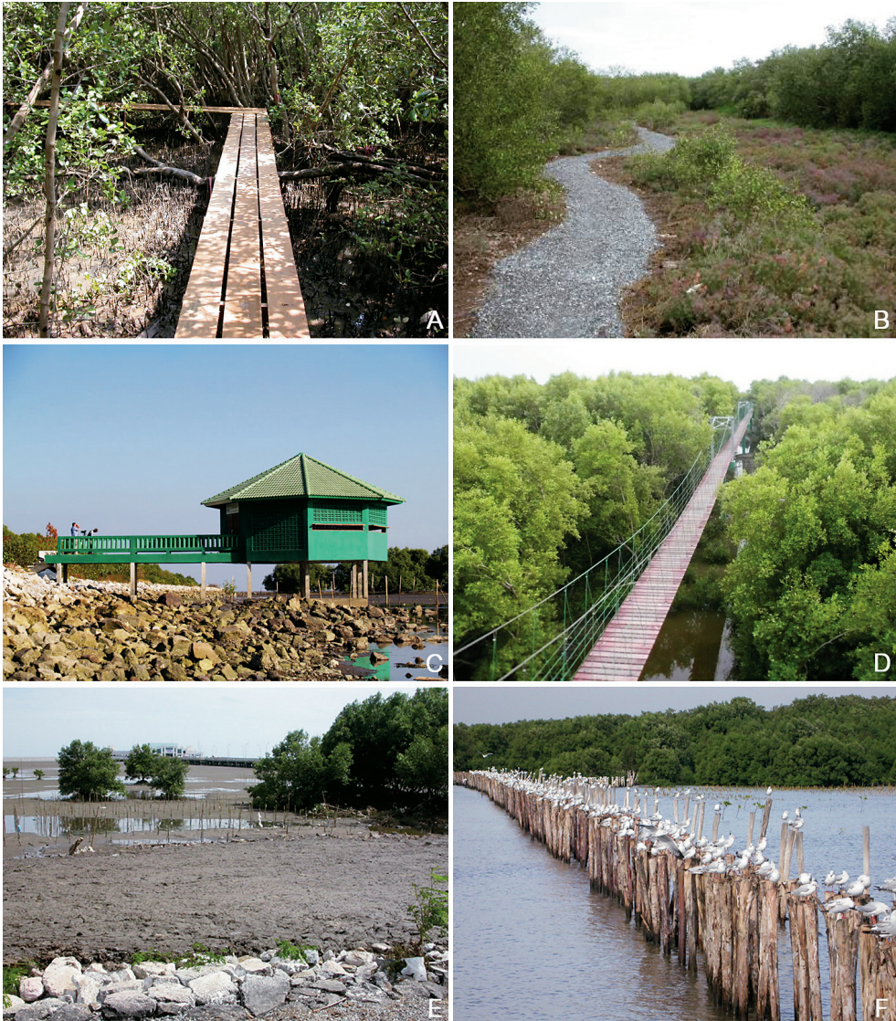
Figure 5. Some infrastructures in Bang Pu Nature Reserve and surrounding mangrove environment: A, boardwalk; B, nature trail; C, bird observation tower; D, canopy observation bridge; E, exposed mudflats at low tide in front of the reserve, with Sukta pier behind; and F, Brown-headed Gulls resting on wood pilings on mudflats in front of the reserve.