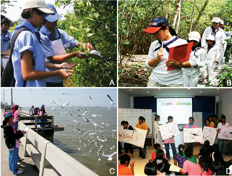
Figure 6. Educational activities of BNEC conducted in the reserve and surrounding area: A, students observing structure of mangrove leaves during ecological course; B, students studying root systems of trees within the nature reserve from a board walk; C, students learning to identify species of gulls at Sukta Pier; and D, groups of students presenting their observation results in the nature reserve and sharing knowledge with other groups at BNEC.

Despite the massive land-use changes within recent decades, the Inner Gulf area remains of international importance as a staging post and wintering area for shorebirds. Some 150–300,000 migratory waterbirds use the site annually (BCST, 2004); of these, Bang Pu regularly supports concentrations of 10,000–20,000 shorebirds, terns and gulls. The Inner Gulf, comprising the Bang Pu site, has been identified as an Important Bird Area (BCST, 2004).