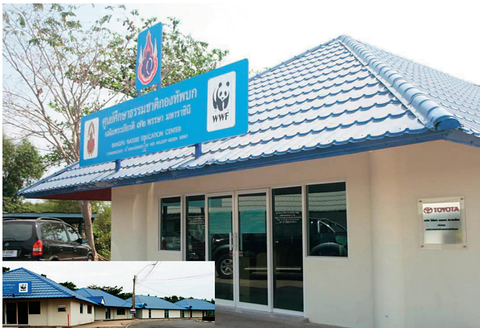
Figure 3. Bang Pu Nature Education Centre.