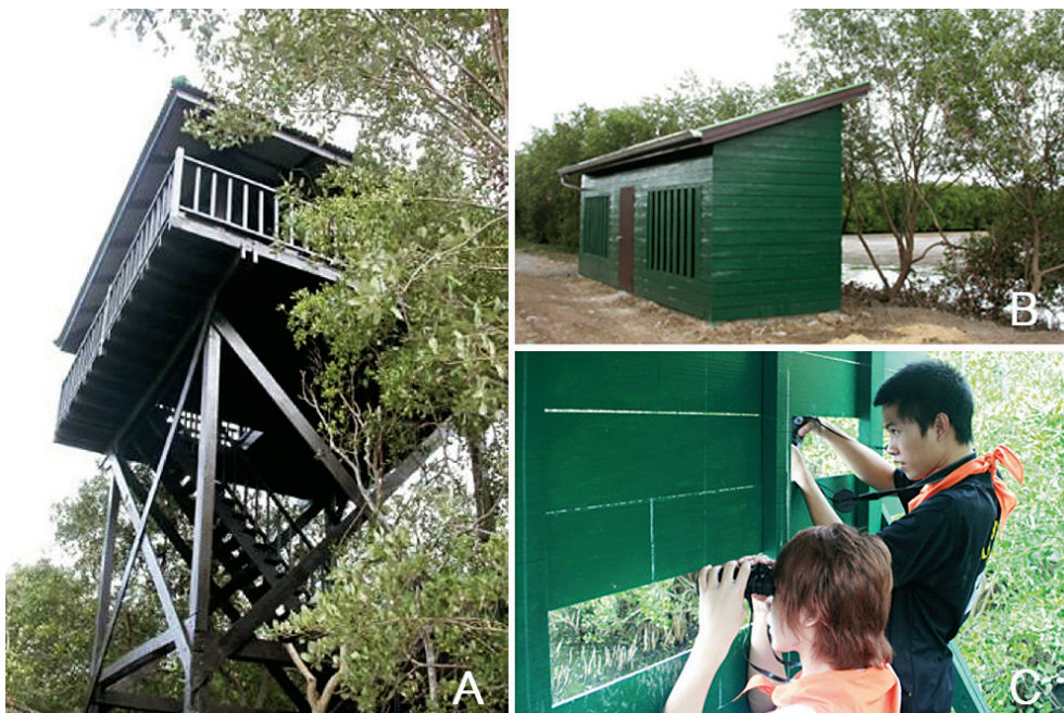
Figure 4. Some facilities in Bang Pu Nature Reserve: A, canopy observation tower; B, bird observation hide; and, C, visitors watching birds from a bird blind.