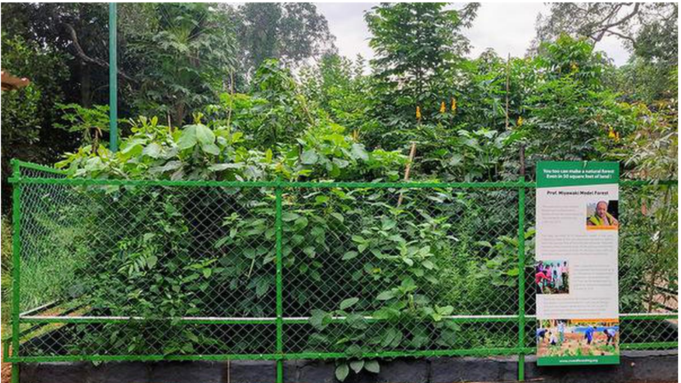
The Miyawaki forest at Kanakakkunnu grounds.

The 'baby forest' in the capital city is turning a year old.